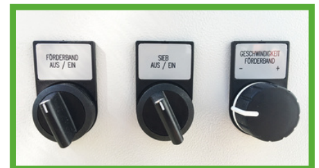
High-quality control incl. frequency converter