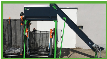
High quality and stable frame construction

Dust-free pellets represent a high quality standard. Thanks to ECOKRAFT's innovative screening system, the pellets are first gently transported away via a conveyor belt and thus already cooled naturally. During the screening process, the so-called pellet breakage (dust and pellets that are too short) is sorted out. This process represents a significant increase in the value of pellets for resale.